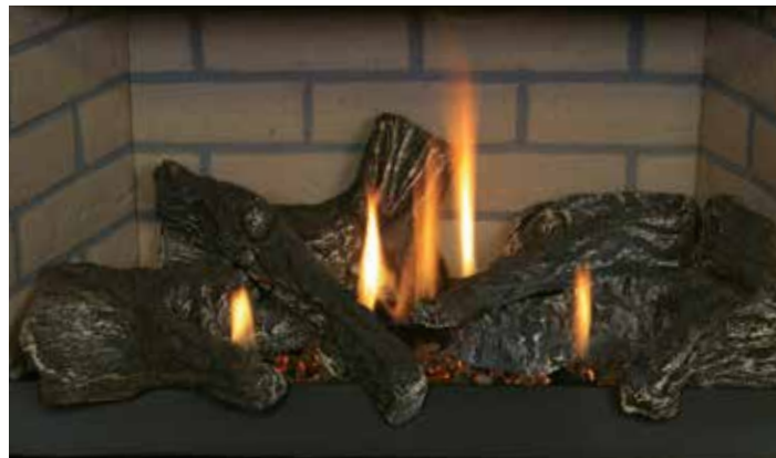
DRT 2033 Shown with Buff Stacked Liner

On the cover: DRT2033 shown with Black Painted Interior