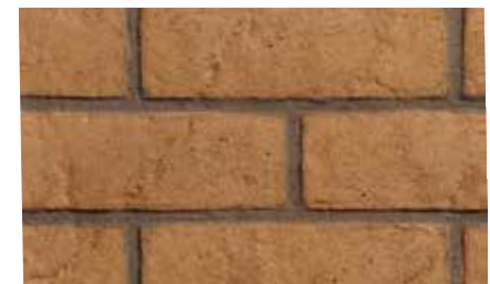
Buff Stacked Liner