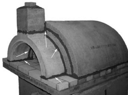
Completed Installation, Ready for Finish Application

Apply mortar to all joints, parge interior tunnel joints, and add chimney sections as required.