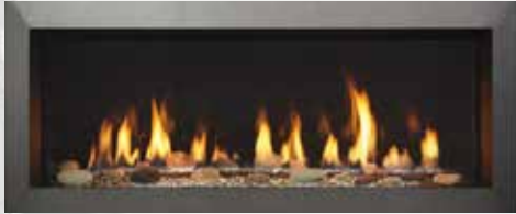
Picture Frame Front (available in Charcoal and Pewter for the 36", 48", and 60")