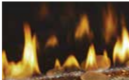
Reflective Black Glass Panels