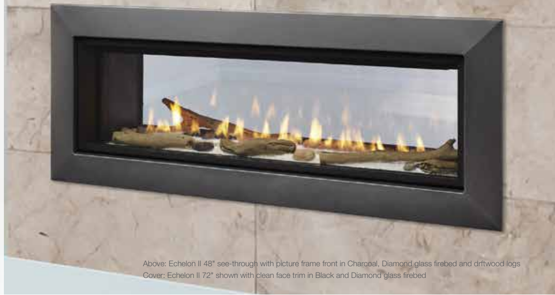
Above: Echelon II 48" see-through with picture frame front in Charcoal, Diamond glass firebed and driftwood logs Cover: Echelon II 72" shown with clean face trim in Black and Diamond glass firebed