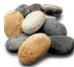
Natural Stone Kit