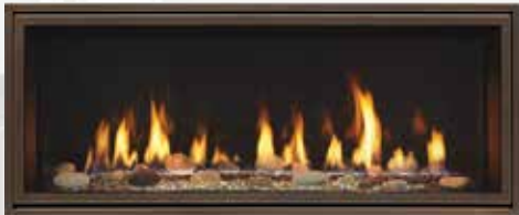
Clean Face Trim (available in Black, Bronze and Pewter)