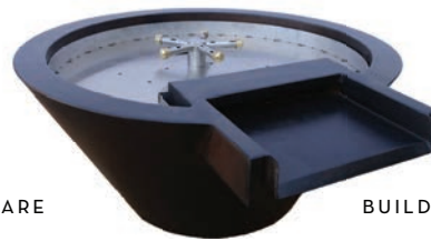
BUILDER SERIES ROUND