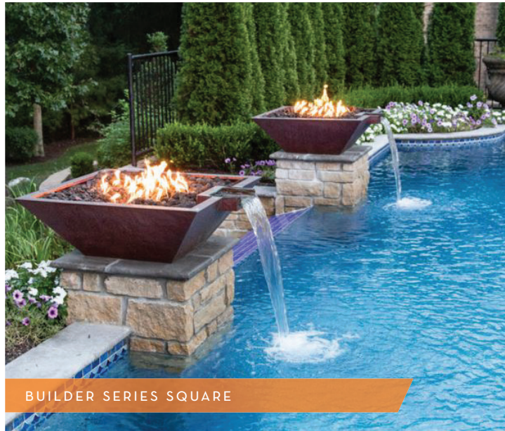
BUILDER SERIES SQUARE