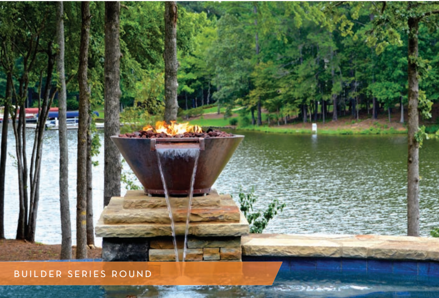
BUILDER SERIES ROUND