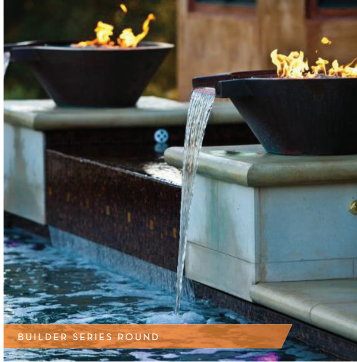
BUILDER SERIES ROUND

The Builder Series is our most cost efficient line that combines water and fire into a single bowl design. Available for manual or automatic ignitions.