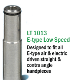
LT 1013 E-type Low Speed Designed to fit all E-type air & electric driven straight & contra angle handpieces