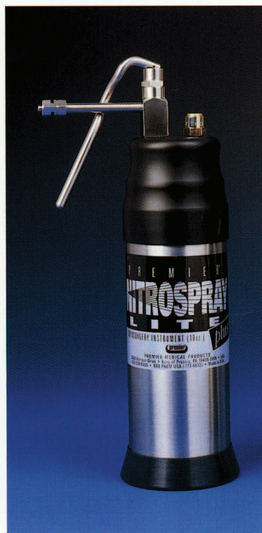
6065 Nitrospray Plus Lite (10oz fill capacity) Includes 5 spray tips, tip protector and base holder