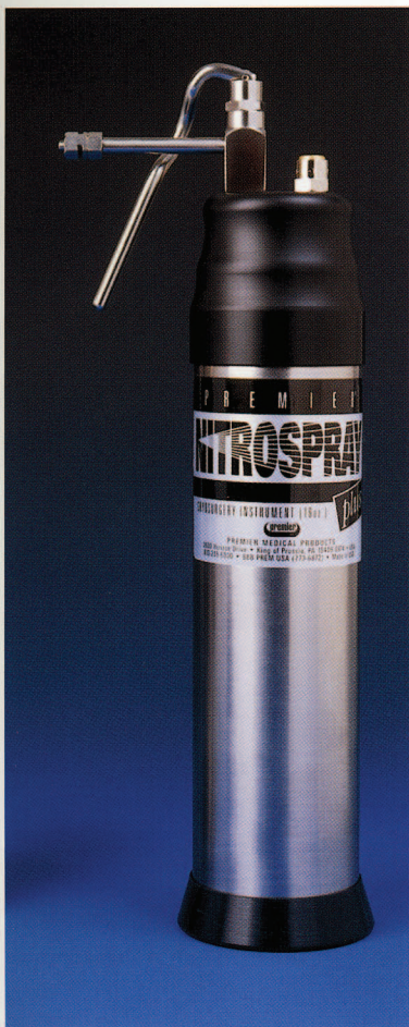
6060 Nitrospray Plus (16oz fill capacity) Includes 5 spray tips, tip protector and base holder

Intermittent use: 3 - 6 hours of patient treatment time