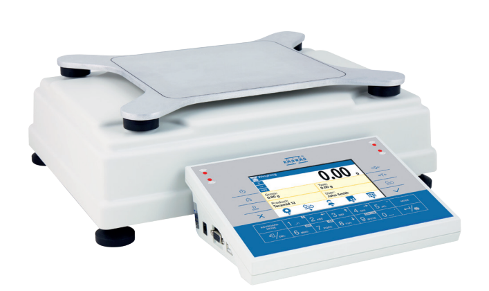
PM C32, d = 0.01 g

'Advanced level' measurement of large masses with the highest accuracy in laboratory and industry