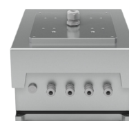
Easy access to the most functional interfaces