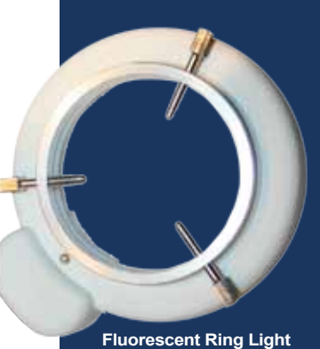
Variable Fluorescent and LED