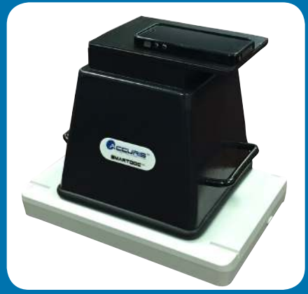
Use with SmartDoc™ for gel imaging with a cell phone