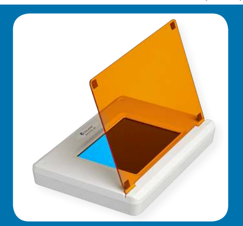
Amber cover raised for easy gel access

An array of super bright LEDs with a long, 30,000 hour service life provide the light source for the SmartBlue Transilluminator. Unlike those in a UV transilluminator, the filters in the SmartBlue will not solarize and degrade in performance over time. Gel bands can be excised directly on the scratch resistant, glass viewing surface. To save energy, the power switch includes an automatic 5 minute shutoff. The SmartBlue Transilluminator is covered by a 2 year warranty.