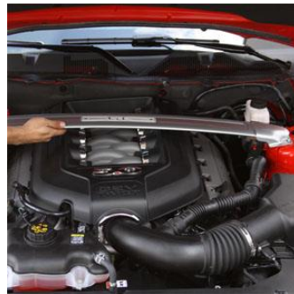
Remove the strut tower brace.