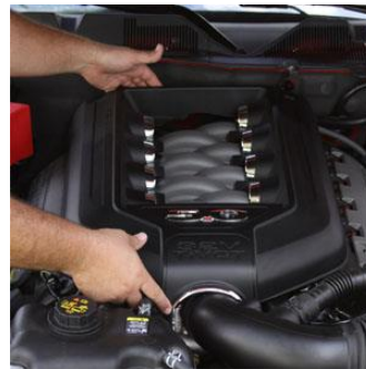
Remove the plastic intake cover by pulling straight up on it.