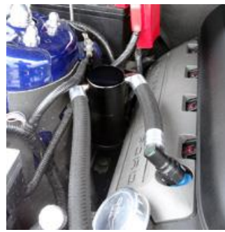
Install the short hose on the inlet side of catch can and then snap it onto the valve cover fitting. The long hose goes to the outlet side of the catch can and connects to the intake.