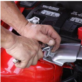
Remove the (4) 13mm nuts holding the strut tower brace in place if equipped.