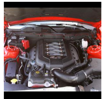
Reinstall plastic intake cover and strut tower brace.

NEVER RETURN OIL FROM THE CATCH CAN BACK INTO THE ENGINE