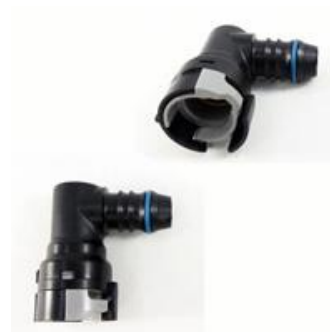
Press the OEM Ford fitting onto the end of each piece of provided hose.