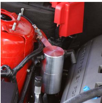
Mount to the passenger side strut tower. Use the factory bolt and bolt hole for the ground wire.