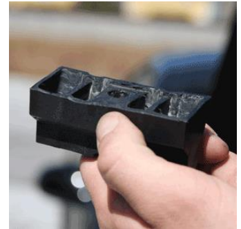
When finished it should look like this.