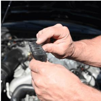
Remove factory battery hold down.