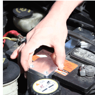
Install the short bracket to the bottom of one side of the top bracket with provided allen bolts. Place it on top of the battery.