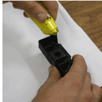
There are two supports that need to be trimmed down the same height as the center piece where the stock bolt goes.