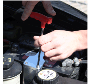
Line up the top bracket with the big side bracket and install allen bolts and tighten down securing the battery.