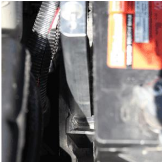
Place the factory mount into position and put the aluminum side mount on top while running the long threaded rod through the center.