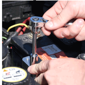
Screw the thread rod down so that the top of the rod sits below the body of the bracket then place the nut on top and tighten down.