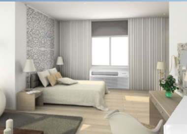
Hotels / Apartments