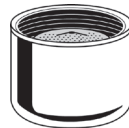
Small Female VP