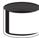
Regular Female VP