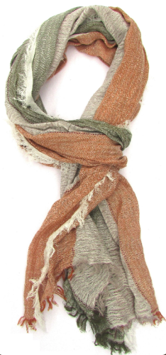
2101105 Tobacco / Green / White