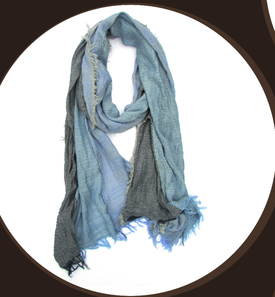
2101103 Pink / White / Blue