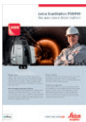
Leica ScanStation P30/40

Illustrations, descriptions and technical specifications are not binding. All rights reserved. Printed in Switzerland – Copyright Leica Geosystems AG, Heerbrugg, Switzerland 2015. 835466en - 03.15 - INT