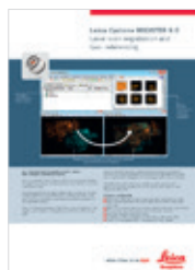
Leica Cyclone REGISTER