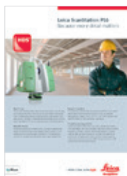
Leica ScanStation P16

Illustrations, descriptions and technical specifications are not binding. All rights reserved. Printed in Switzerland – Copyright Leica Geosystems AG, Heerbrugg, Switzerland 2015. 832258en – 03.15 – INT