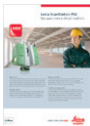
Leica ScanStation P16

Illustrations, descriptions and technical specifications are not binding. All rights reserved. Printed in Switzerland – Copyright Leica Geosystems AG, Heerbrugg, Switzerland 2015. 832271en – 03.15 – INT