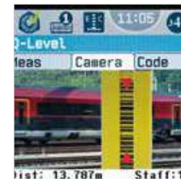
DIGITAL CAMERA AIMING