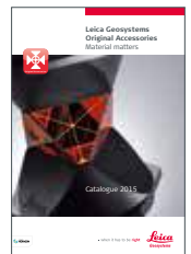
Leica Original Accessories

Leica Geosystems AG Heerbrugg, Switzerland