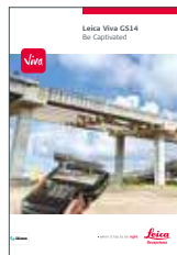
Leica Viva GS14