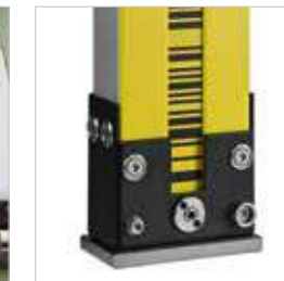
USE STANDARD INVAR STAFF