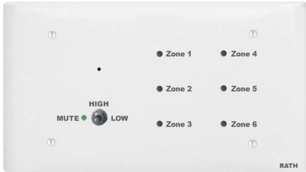
6 Zone Annunciator 2900-6AP

Face plate: 5.75" H x 10.25" W x 2.63" D