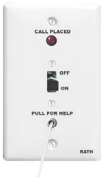
Pull String Station 2900-1PS Series (Single Gang)