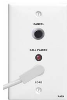
Single Bedside Station 2900-1BS Series (Single Gang)