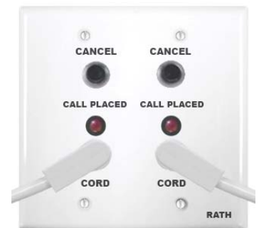
Dual Bedside Station 2900-2DBS Series (Two Gang)