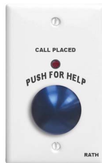
Code Blue Station 2900-1CB Series (Single Gang)