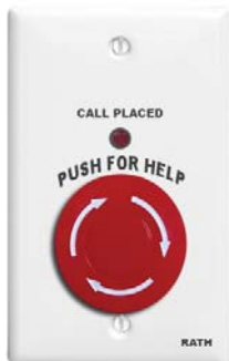
Panic Station 2900-1PB Series (Single Gang)