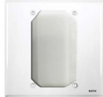
Dome Light 2900-2DL Series (Two Gang)