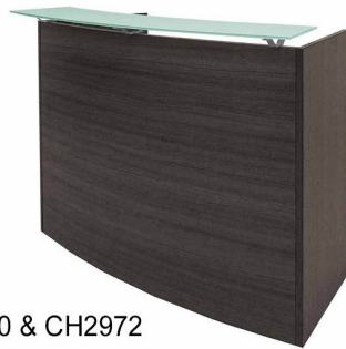
CH2960 & CH2972