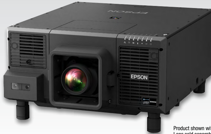
Product shown with lens. Lens sold separately.