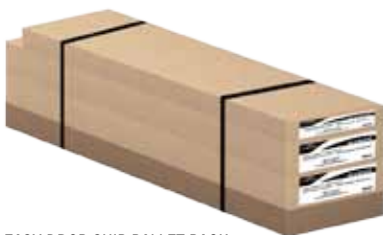
EASY DROP SHIP PALLET PACK Pre Palletized 3 Box Unit