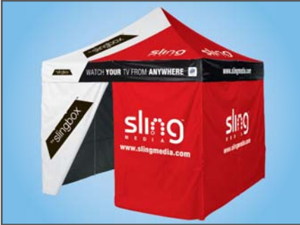
MIDDLE ZIPPER: Extra middle zipper opens and closes easily for entrance to an enclosed shelter. Also available in four stock colors.

Enhance your shelter with E-Z UP® Sidewalls. From one sidewall as a backdrop, to a fully enclosed shelter with four sidewalls, you can custom order what is right for your intended use. E-Z UP offers several different sidewall options, all of which are customizable with 22 fabric choices. Coordinate your sidewalls with your shelter using custom fabric colors; add imprint graphics or full - bleed digital printing for extra attention.