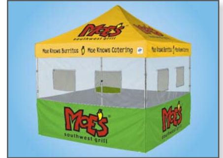
FOOD BOOTH: Commercial grade mesh with roll up windows on the upper portion and fabric on the lower portion.