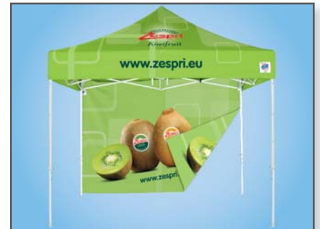
DOUBLE - SIDED: Custom printing on both sides.

Sponsorship Recognition Advertisement Property Management Parades Festivals Grand Openings Fundraisers Instant Signage Food Court Areas Catering Street Fairs Indoor & Outdoor Display Hospital/Medical Commercial Use Rental Industry Charitable Events Portable Signage Conventions Product Launch