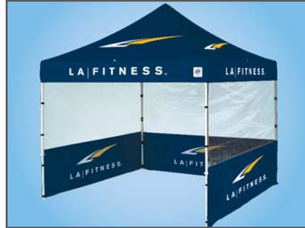
PANORAMA: Clear vinyl panels on the upper portion and fabric on the lower portion for E - Z viewing while keeping out the elements.