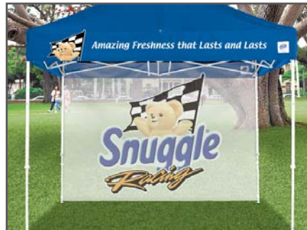
MESH: Professional white vinyl mesh for insect screening. DIGITAL MESH: Professional white vinyl mesh digitally printed.