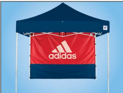
STANDARD: Custom printing on one side. Also available in four stock colors.