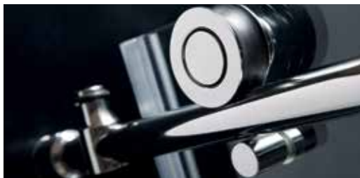
STAINLESS STEEL WHEEL ASSEMBLY