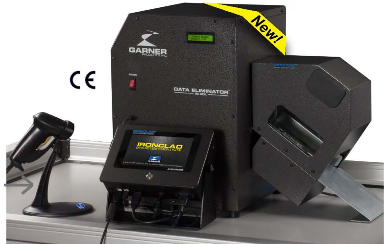
HD-3WXL degausser with IRONCLAD shown