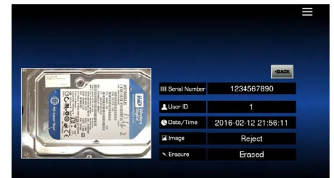
Detailed record of erasure status