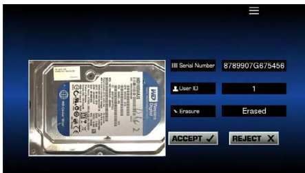
Accept or reject image