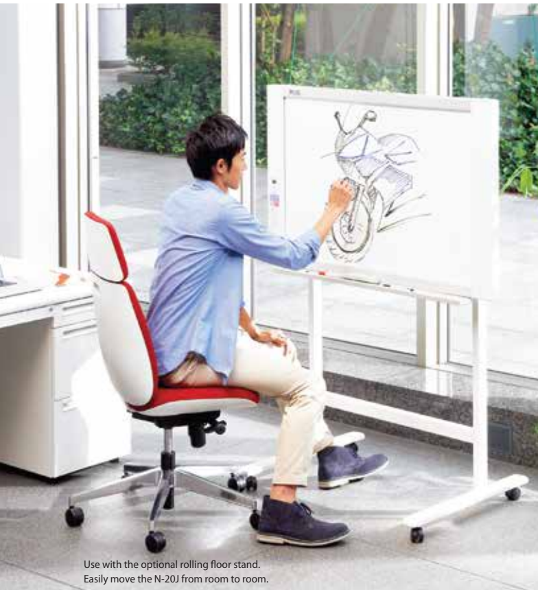
Use with the optional rolling floor stand. Easily move the N-20J from room to room.