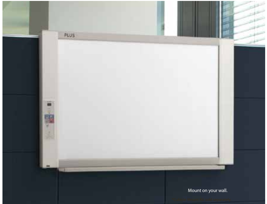
Mount on your wall.