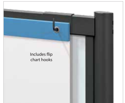
Includes flip chart hooks