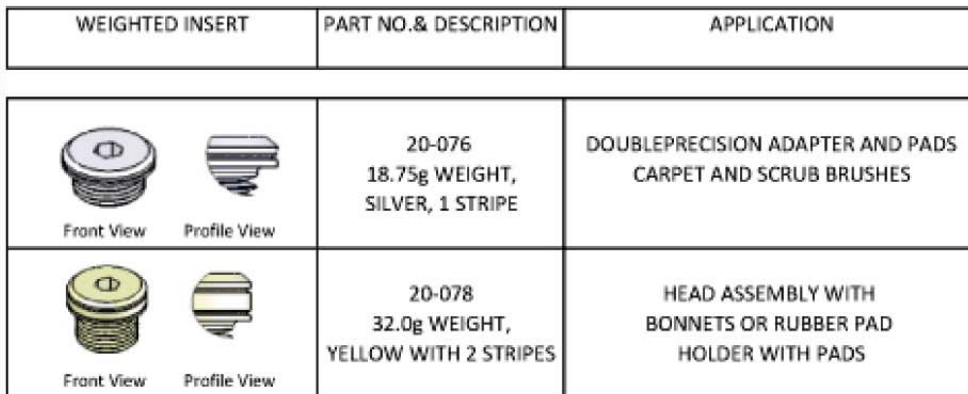
TABLE 1: ADJUSTABLE COUNTERWEIGHT APPLICATION TABLE