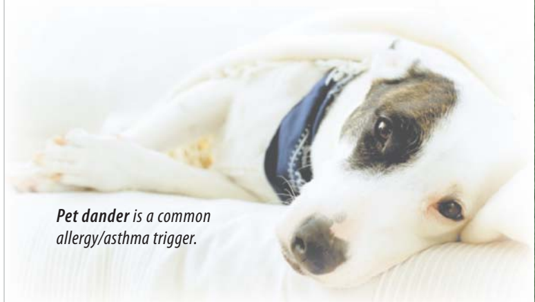
Pet dander is a common allergy/asthma trigger.