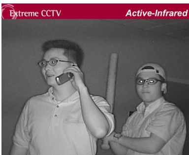
Under the same, totally dark conditions, active-infrared provides a clear picture that easily identifies the subjects.