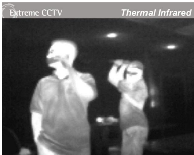
Thermal images typically deliver low resolution video which cannot be used for identification purposes.