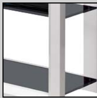
Smoked glass shelves