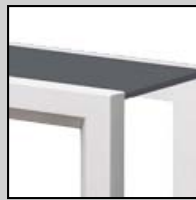
Picture frame inspired chamfered edge