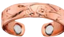
Copper Floral Ring .....$10.00