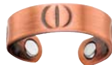
Copper Screw Design .....$10.00