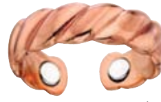
Shiny Woven Wide .....$10.00