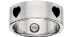
Sterling Silver Heart Ring .....$24.50