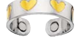
Gold Hearts Ring .....$12.50