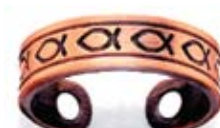
Darwin Ring .....$10.00