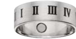
Sterling Silver Roman Numeral Ring ....$24.50

We proudly stand behind every magnetic ring we make with a 60 day money back guarantee.