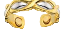
Hugs & Kisses Ring.....$12.50