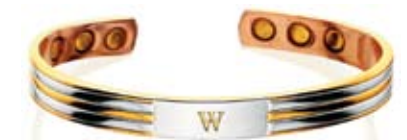
.....$29.95 W "Dubya" 6 Mag GSG

3/8" wide - W "Dubya" Six Magnet - For politically persuaded fans of the Commander-in-Chief, George W. Bush. This magnetic sports band is plated on the outside with three strips of 18K gold and two strips of polished stainless steel for a jewelry look. Six 1500 gauss neodymium magnets are neatly embedded.