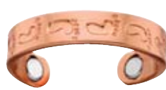
Copper Foot Prints.....$10.00