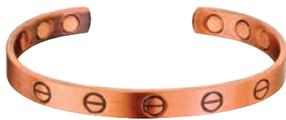
.....$20.00 Copper Screw Design

1/4" wide - Perfect for the office, as well as your busy weekend schedule. Our laser point neodymium north facing magnets are permanent – What does this mean? These magnets will not lose their strength over time.