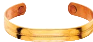
.....$25.00 Windsor Gold

1/4" wide - Copper bracelet with magnets in a great classic design. limited quantity - limited size range - get'em while they last. S - XL