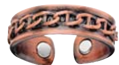
Copper Chain Ring.....$10.00