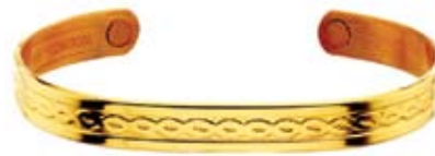
.....$25.00 Sabona Tudor Gold

1/2" wide - Want an earthy look with magnets in every link too? Know someone who wants a magnetic link bracelet but somewhat toned down from the stainless models we offer? No problem - we can fill your order with our new and different (faux copper) link design with 1500 gauss magnets in every link of this alloy smart buy. S - M - L - XL