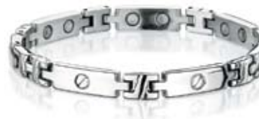
10C ..... $49.95 Double the Magnets POLISHED STAINLESS STEEL TWO 3300 GAUSS MAGNETS PER LINK

1/4" wide - This bracelet can get wet – you can wear it 24/7. Each style has ten, twelve or fourteen magnets depending on the size you choose.