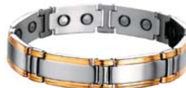
12B ..... $49.95 Golfers Edge Unfair Advantage 18K GOLD PLATED & BRUSHED STAINLESS STEEL TWO 3300 GAUSS MAGNETS PER LINK

1/2" wide - Aside from taking strokes off your game "guaranteed," this magnetic bracelet will leave cash in your wallet. A great looking bracelet with not one but two 3300 gauss neodymium magnets in every link.