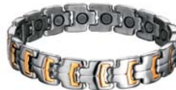
6B ..... $49.95 Mega Magnet POLISHED 18K GOLD PLATED & BRUSHED STAINLESS STEEL 3800 GAUSS IN EACH LINK

1/2" wide - What can we say - just look at the workmanship - magnets in every link. 18K gold and brushed stainless steel for an understated, classy and strong look.