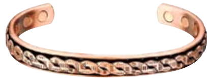
.....$20.00 Vines of Life

3/8" wide - Six 1500 gauss laser point neodymium north facing magnets embedded within this unique motif. This unisex magnetic copper bracelet is polished copper inside and an antique copper finish outside.