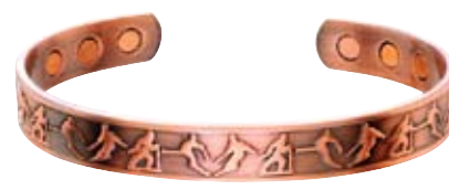
.....$15.00 Sports Copper

1/2" wide - Copper magnetic bracelet for that skier, hiker or extreme suburban power walker in you. Know someone that this piece brings to mind? Take action, be a sport, don't hesitate giving this gift to that person your thinking of right now!