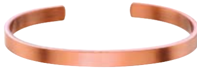
.....$12.50 Plain Copper Bracelet

1/4" wide - We have exactly what you have been searching for - A plain copper bracelet with no design on the outside and 6 powerful laser point neodymium magnets facing north to the skin for optimum performance. S - M - L - XL - XXL