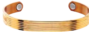
.....$25.00 Regency Gold

1/4" wide - Why pay $59.95 when you can buy this gold plated magnetic bracelet with an exposed copper interior bracelet for only $25.00 right here - right now? S - M - L - XL