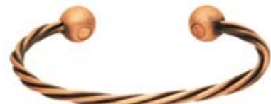
.....$14.95 Copper Cable

3/8" wide - Democratic National Committee 6 magnet. Politically persuaded for the Democrat fan! This copper sports band is plated with three strips of 18K gold and two strips of polished stainless steel for a jewelry look. Six 1500 gauss magnets are embedded like some Fox news TV analysts - you can't get them out!! L