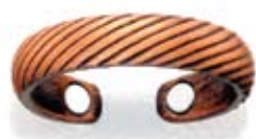
Woven Stripes .....$10.00