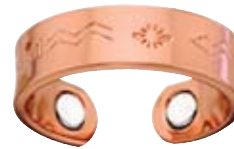
Egyptian Symbols of Life $10.00