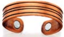
Pin Striped Copper .....$10.00

The magnetic finger and toe rings on this section page are crafted with copper, sterling silver or titanium. Copper and silver rings have two 1500 gauss magnets each. Titanium rings have three 2000 gauss magnets each. Stainless steel rings have four 1500 gauss magnets each.