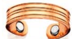
Shiny Pin Striped.....$10.00