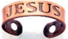
Jesus Ring .....$10.00