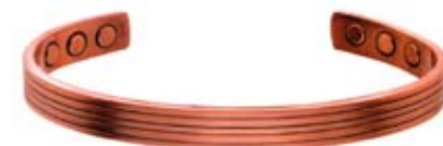
.....$20.00 Copper Bracelet 6 Mag

3/8" wide - Pin striped copper bracelet with six - that's right, count em - six 1500 gauss magnets for a really nice clean looking copper bracelet.