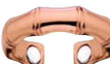
Copper Bamboo Ring .....$10.00