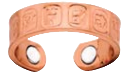
China Symbols of Love ..$10.00