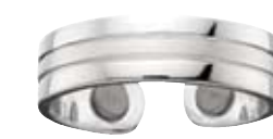
Sterling Silver Toe Ring .....$22.50