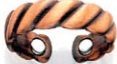
Woven Wide .....$10.00