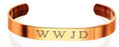
.....$12.50 W.W.J.D. What Would Jesus Do? 1300 GAUSS MAGNETS

3/8" wide - WHAT WOULD JESUS DO? Comes packaged with a keepsake card listing the 10 commandments with a picture of Jesus. This copper bracelet is 99% pure copper, no lead, non-binding, non-restrictive and will mold to any wrist shape. Clear coat to maintain shine will wear off after a few days.