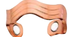
Copper Curvy Curves.....$10.00