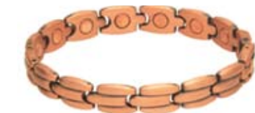
2D.....$22.50 Antique Copper Link

1/4" wide - Copper bracelet with 6 magnets. Talk about an affordable way to buy a copper magnetic bracelet - Yes - we have you covered on this one for only $17.50. S - M - L - XL