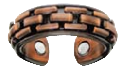
Copper Basketweave .....$10.00