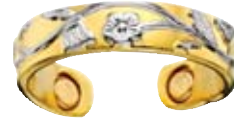
Floral Ring .....$12.50