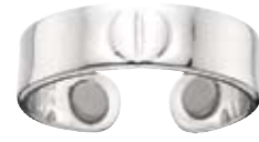
Sterling Silver Screw Design Ring .....$22.50