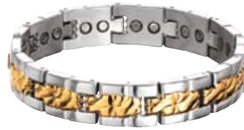
1A ..... $49.95 "Arnold Palmer's" Favorite 18K GOLD PLATED & STAINLESS STEEL

AceMagnetics stainless steel magnetic bracelets are crafted from the highest quality metal in its category - 316L stainless steel (nickel free). Our magnetic bracelets are embedded with powerful 3000 - 3800 gauss neodymium north-facing magnets in every link that are permanent – they will not lose their strength!