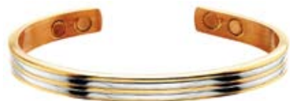
.....$24.95 GSG 4 Mag

3/8" wide - Gold-Silver-Gold-Four-Magnet. This copper, magnetic sports band is plated with alternating strips of gold-silver-gold on the exterior for a beautiful jewelry look. Embedded with four 1700 gauss magnets built-in and you have a very powerful magnetic cuff style bracelet for a very affordable price.