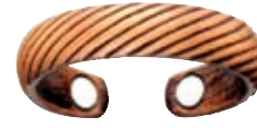
Copper Stripes .....$10.00