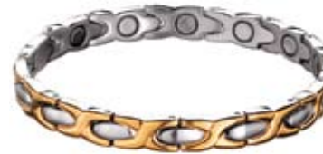
5B ..... $49.95 Ladies' # 1 Choice POLISHED 18K GOLD PLATED & FROSTED STAINLESS STEEL 3800 GAUSS MAGNETS

1/4" wide - New Hugs & Kisses ladies' bracelet. Wear for all occasions. The 5B is polished 18K gold and frosted stainless steel for a clean, smart and classy appearance - you will enjoy this bracelet!