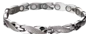
11C ..... $49.95 Crisscross POLISHED STAINLESS STEEL TWO 3300 GAUSS MAGNETS PER LINK

1/4" wide - Now with two magnets and 6600 gauss per link! We hope you will like this one as much as we do. We crafted this piece with 3300 gauss neodymium north facing magnets in every link – this means the magnets will not wear out and your wrist will not turn green while wearing this stainless steel piece.