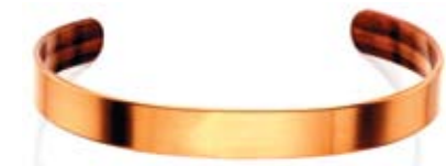
.....$12.50 CB..... Copper Wristband

3/8" wide - Copper wristband - an age-old original.