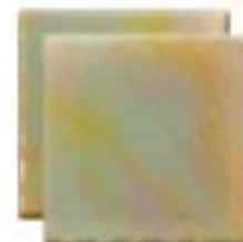
T251I Indized Beige