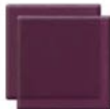
T239CL Deep Purple