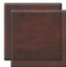
T246CL DK. Amber Clear