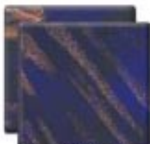
T208G Royal Blue