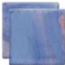
T226G Blue Gray