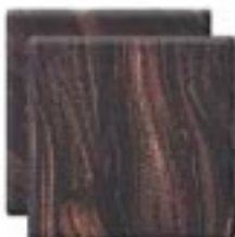
T204G Med. Amber