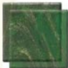
T214G Forest Green