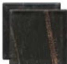
T207G DK. Amber