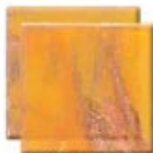
T203G Lt. Amber