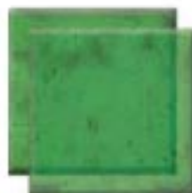
T240CL Bottle Green