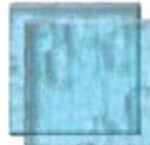
T242CL Bottle Blue