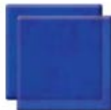
T243CL Royal Blue Clear