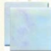
T252I Indized White