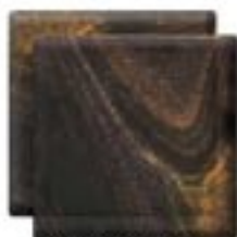
T200G DK. Brown