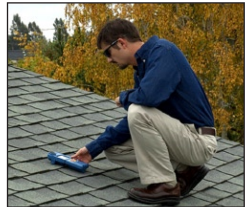
Measuring roof pitch is now integrated into the SunEye 210. Simply lay it on the roof or module and read tilt and heading.