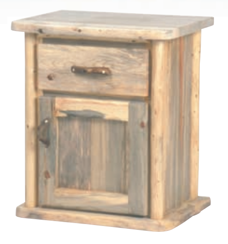
Blue-stain pine Nightstand Shown with flat fronts