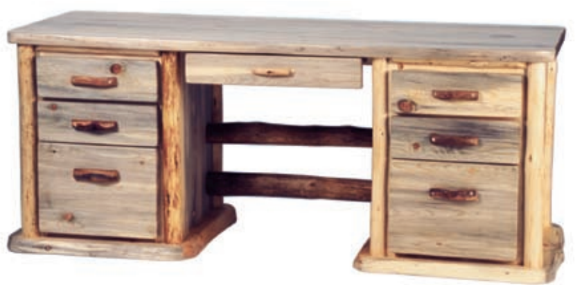
7-Drawer Desk ~ Shown in blue-stain pine with flat fronts