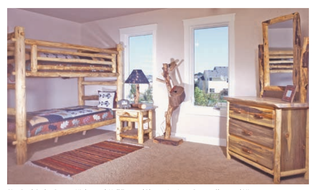
Pine Bunk Bed, 1-Drawer Nightstand, Hall Tree and Blue-stain pine 3-Drawer Chest and Mirror