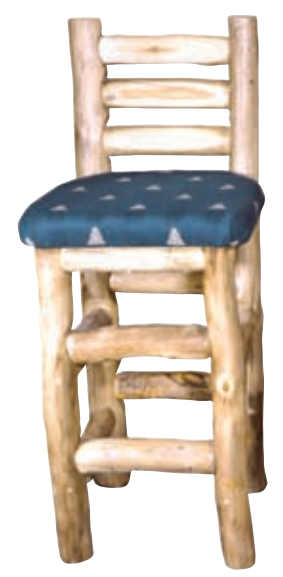
30" Upholstered Barstool with back

Mountain Woods Furniture offers you the widest variety of choices to relax in rustic comfort. Our 30" Barstools (measured from the floor to the top of the seat) are designed to function perfectly with 42" high countertops and bars, while the 24" Barstools work with 36" tops. Select from the barstool options below. Custom heights — not a problem!