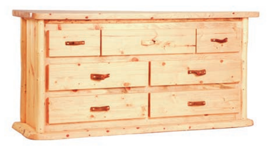
Clear pine 72" 7-Drawer Dresser with flat fronts

Clear pine has a lighter color than aspen, and the knotholes are smaller. Customers select our pine furniture to complement and contrast to aspen and many other wood varieties.