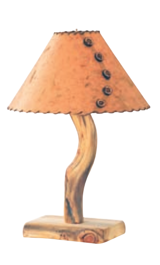
Table Lamp ~ aspen