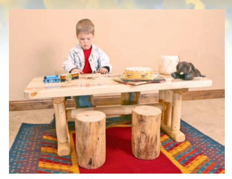
Kid's Table Set ~ comes with four stump seats