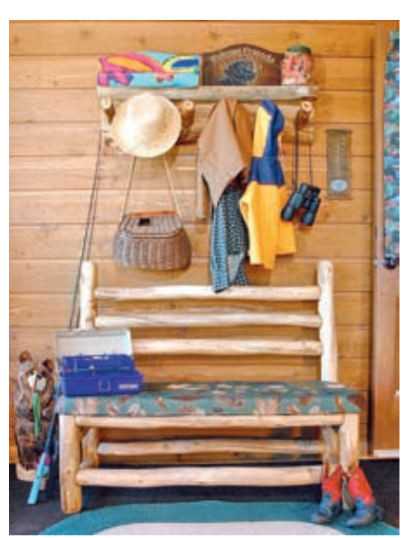
4' Upholstered Bench Chair and 5-Peg Coat Rack with shelf

Give your family some quick-access storage with a rustic flair! Our Bench Chair with coat rack is the perfect hallway/mudroom piece. Our coat racks hold lots of clothing and are available with or without a top shelf. They are pre-drilled for easy mounting. The Hall Tree is great for entryways or bedrooms.