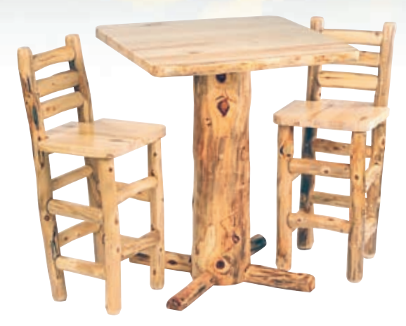
Pub Table and 30" Barstools with back