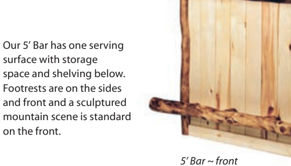
Shown without mountain scene and side footrests