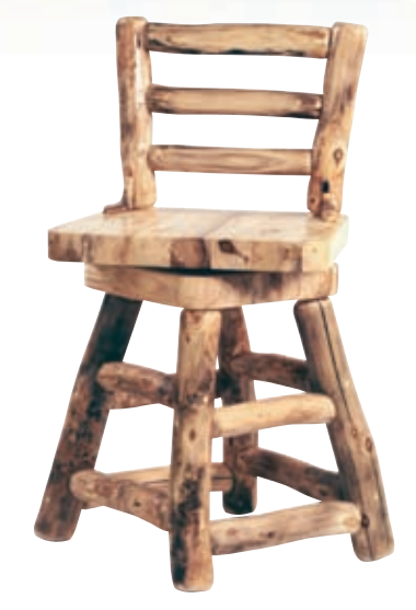
Custom 30" Barstool with back and swivel, with 24 x 24 seat