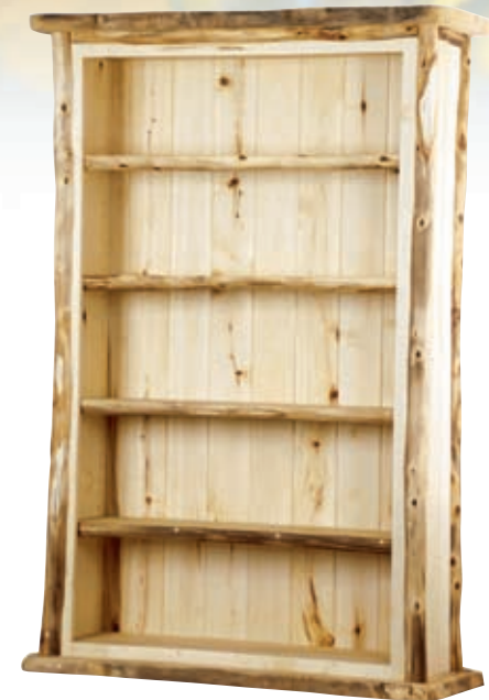
Large 4-Shelf Bookcase