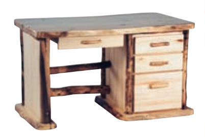
Shown with flat fronts