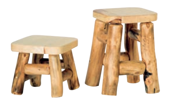
Footstool All-purpose Stool

A warm, sturdy play area for the wee people. Features a 4' table and four log seats.