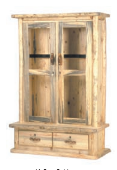
10 Gun Cabinet Shown in blue-stain pine