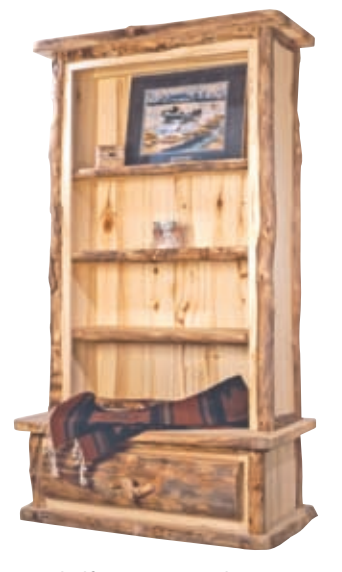
3-Shelf 1-Drawer Bookcase