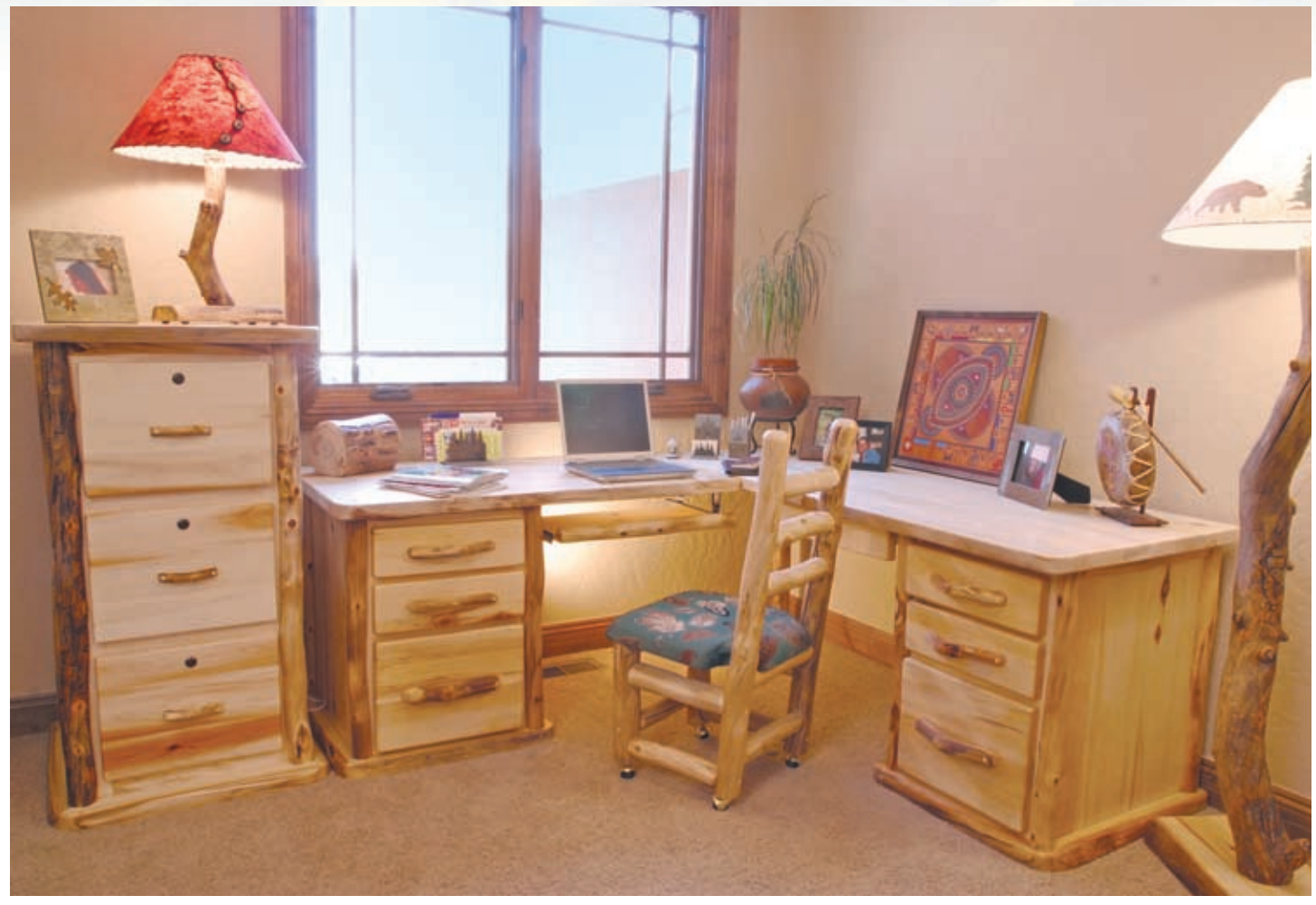
Left to right: 3-Drawer File Cabinet and Table Lamp, L-Shaped Desk (flat front), Upholstered Desk Chair with casters, and Floor Lamp