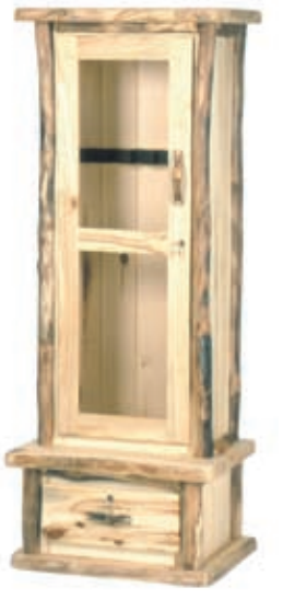
6 Gun Cabinet