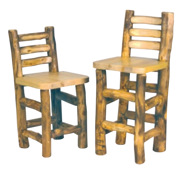
24" and 30" Barstools with back