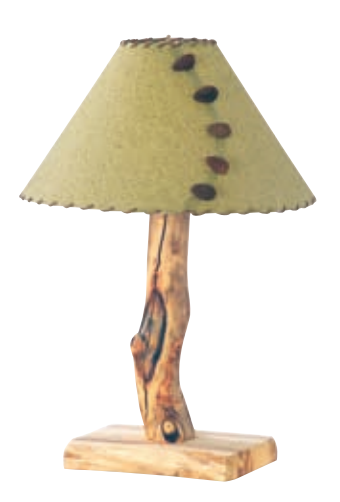
Table Lamp ~ aspen