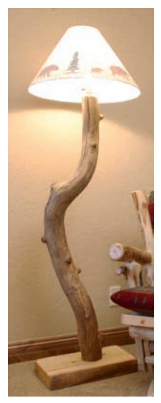
Floor Lamp ~ pine