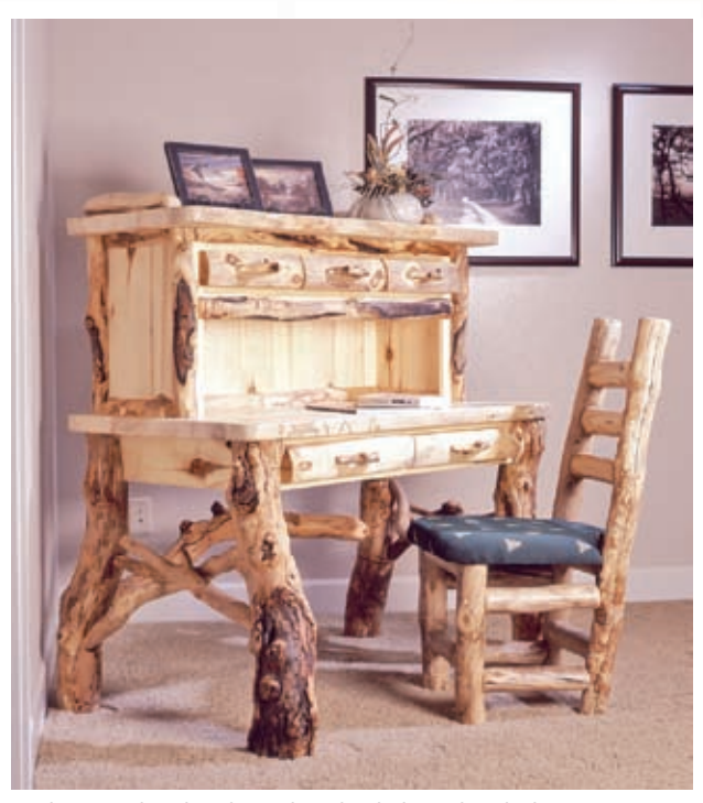
Funky Legged Desk with Hutch and Upholstered Desk Chair

Funky Legged Desk FLD 50" x 28" x 50" Funky Legged Desk w/o Hutch FLD w/o Hutch 50" x 28" x 30"