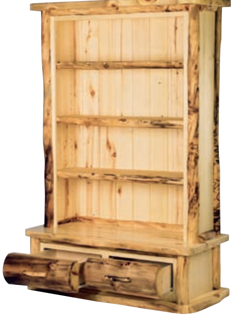
3-Shelf 2-Drawer Bookcase