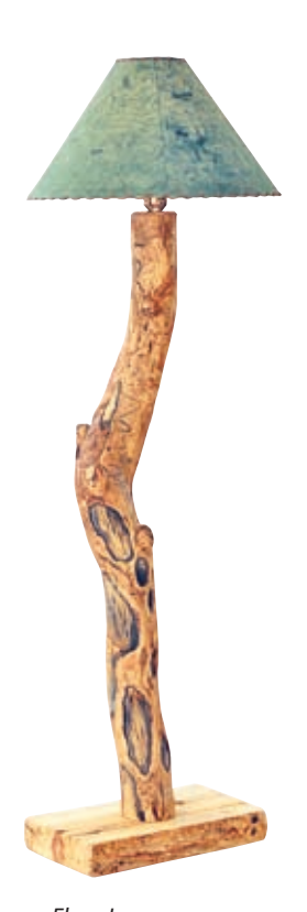
Floor Lamp ~ aspen