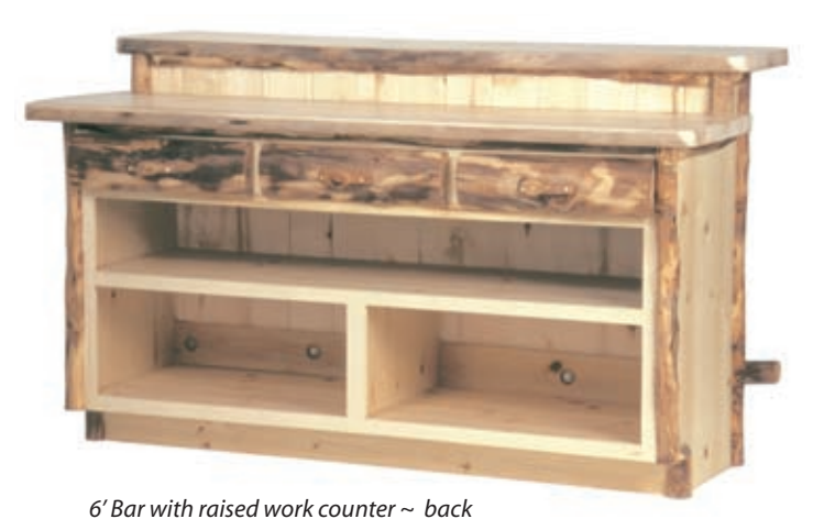
60" x 29" x 42" 72" x 29" x 42" 6' Bar with raised work counter

Our premier 6' Bar features a 42" high raised work counter providing comfortable casual seating. This bar has three drawers, and lots of storage space and shelving underneath. The front shows off a sculpted mountain scene placed over our tongue and groove paneling, and a footrest.