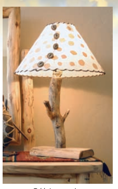
Table Lamp ~ pine