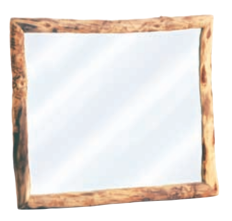
Wall Mount Mirror

Sm. Wall Mount Mirror WMMS 32" x 3" x 24" Wall Mount Mirror WMM 39" x 3" x 33" Cheval Mirror CM 33" x 12" x 69"