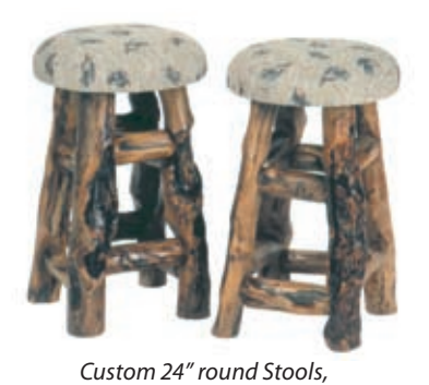
upholstered, with darker stain