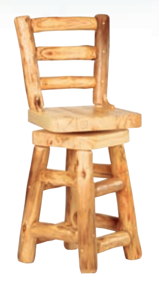
30" Barstool with back and swivel