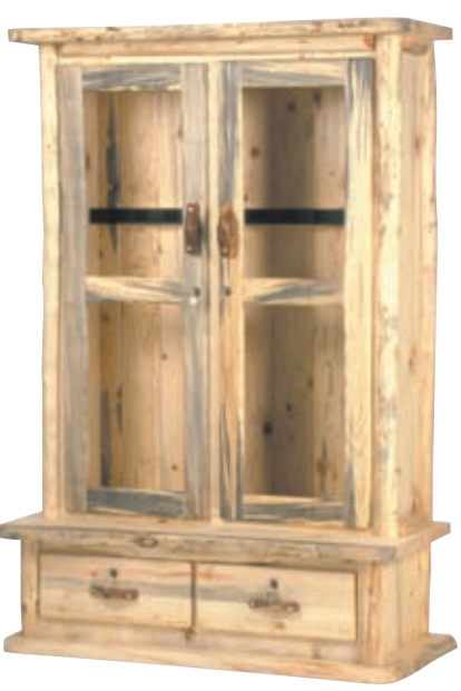
Blue-stain pine 10 Gun Cabinet