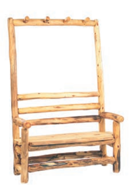
4' Bench Chair with coat rack and arms