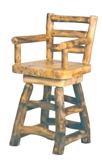
30" Barstool with back, arms and swivel