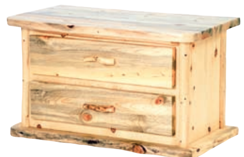
2-Drawer Chest Shown in pine with flat fronts

Chest doubles as a generous storage space and a place for a quick sit-down!