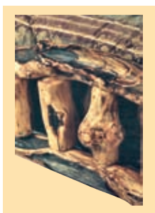
Extra gnarly detail