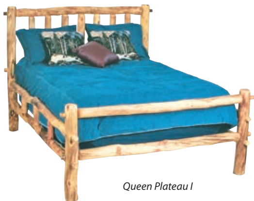
Queen Plateau I

We start with aspen timber that's filled with character created by nature's hand, which our superb craftspeople then convert into magnificent beds.