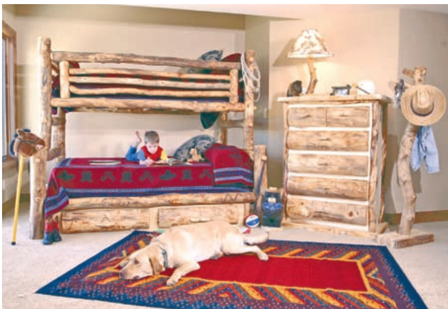
Twin-over-full Bunk Bed, 2-Drawer Underdresser, 5-Drawer Chest with split-top drawer, Table Lamp, and Custom Kids Hall Tree

Kids love these rustic bunk beds for the fun of it, and adults love the extra sleeping capacity. Great for cabins and lodges. The headboard and footboard are created to be the ladder — or order the ladder separately.