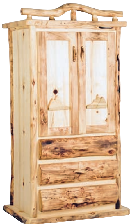
3-Drawer Teton Armoire

Complete your ideal bedroom suite with a stunning armoire that manages your clothing storage or TV/electronics needs. Our Armoire Series has a wardrobe bar in the upper compartment, while the Teton Armoire Series has two adjustable shelves in the upper compartment and a mountain scene carving on the upper doors. All armoire doors have 270 degree hinges for easy interior access and optimal TV viewing.