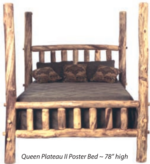
Queen Plateau II Poster Bed ~ 78" high

Add a dramatic accent to your bed with a poster, canopy, or extra gnarly bed upgrade. Available in all bed sizes.