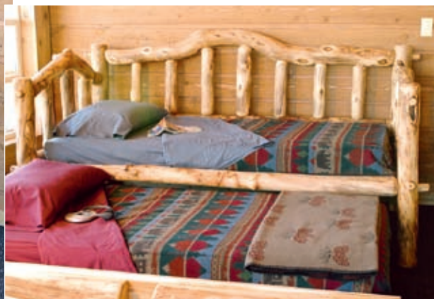
Snowload Daybed with trundle bed accessible