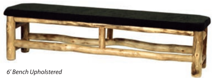
6' Bench Upholstered