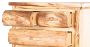
Split-top drawer option