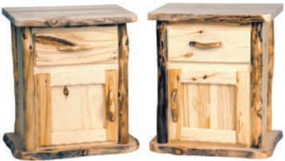
1-Drawer, 1-Door Nightstands Shown with flat fronts