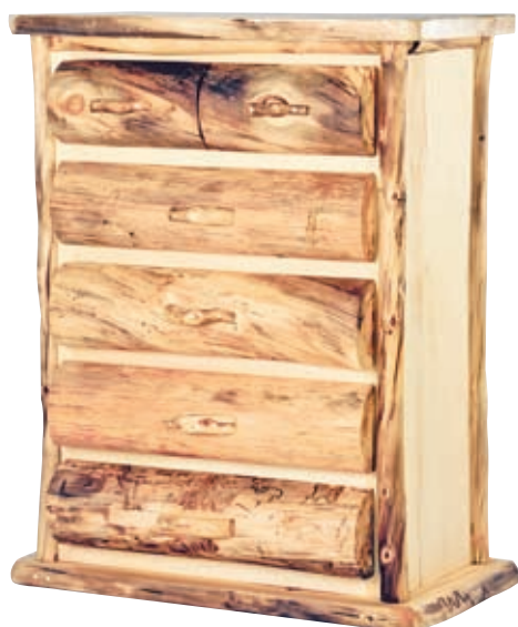
5-Drawer Chest with split-top drawer

Choose the perfect size and style to meet all your storage needs, while adding functional art to all your bedrooms. Our standard chest has a variety of drawer configurations, while the lingerie chest offers storage options for tighter spaces.