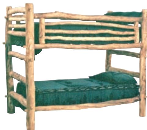
Twin-over-twin Bunk Bed

*Bunk board or plywood for mattress support not included.