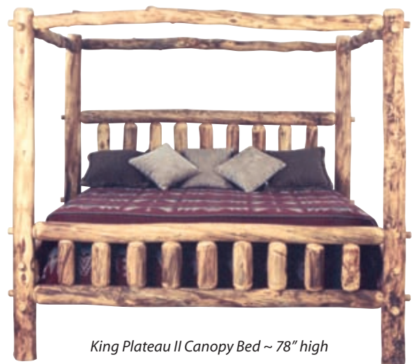
King Plateau II Canopy Bed ~ 78" high