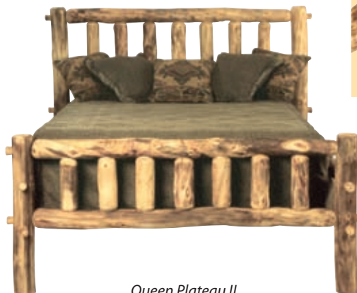
Queen Plateau II

Plateau I ~ This series features straight rails across the headboard and footboard, with vertical spindles in the headboard only.