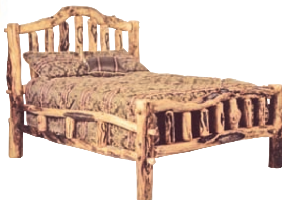
Queen Snowload II with extra gnarly upgrade

Twin 52" x 86" x 52"* Full 67" x 86" x 52"* Queen 73" x 92" x 52"* King 92" x 92" x 52"* Cal-King 88" x 98" x 52"* *Add six inches to headboard height for the Snowload series.