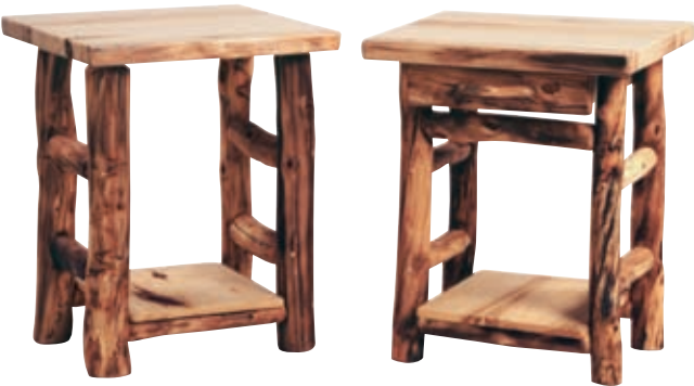
Nightstand and 1-Drawer Nightstand

Our rustic aspen nightstands accommodate your bedside needs. Also convenient in the hallway, bath, or other rooms.