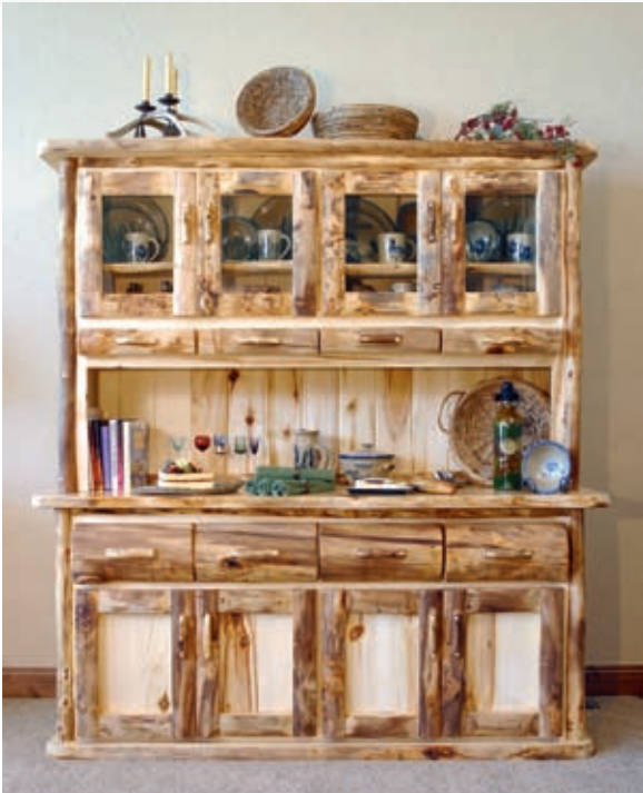
Large Buffet and Hutch

Our signature Large Buffet and Hutch combination will make a statement in your dining room. The hutch top features an adjustable shelf behind each set of glass doors and four decorative utility drawers. The buffet offers four silverware/linen drawers and a fixed shelf behind the cabinet doors.