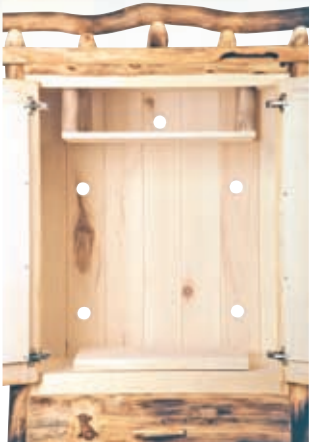
TV swivel and/or VCR or DVD shelf upgrade available on all armoires.