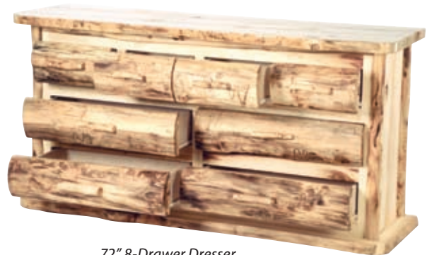
72" 8-Drawer Dresser