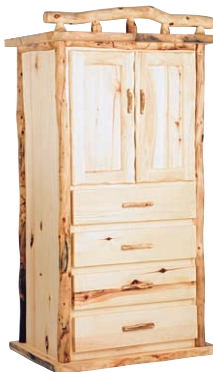
4-Drawer Armoire ~ Shown with flat fronts