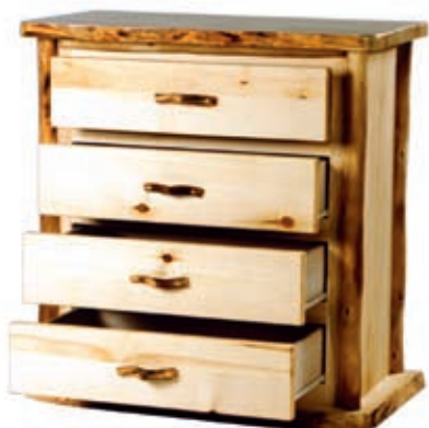
4-Drawer Chest Shown with flat fronts