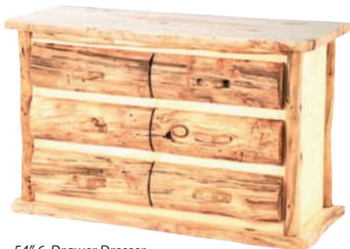
54" 6-Drawer Dresser