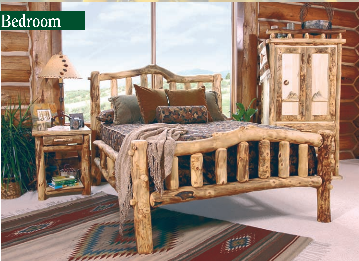
Queen Snowload II, 1-Drawer Nightstand, 3-Drawer Teton Armoire