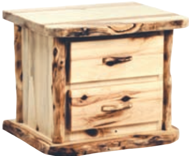
2-Drawer Nightstand Shown with flat fronts