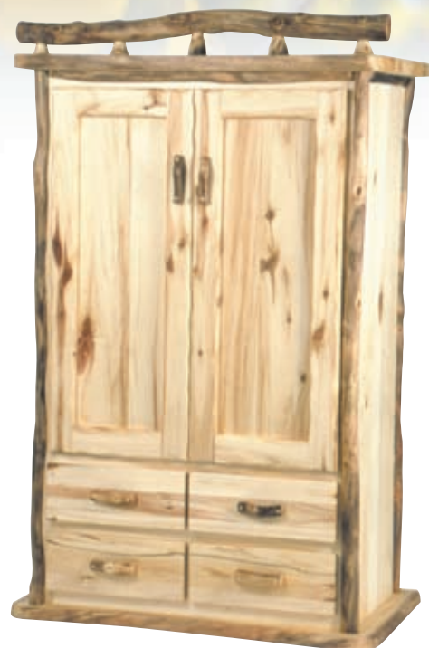
Large 4-Drawer Cedar-lined Armoire Shown with flat fronts

The warmth and beauty of the outside is complemented by the soft aroma of cedar lining on the inside.