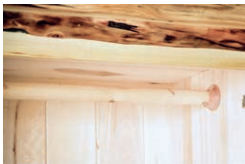
Wardrobe bar standard on armoires.