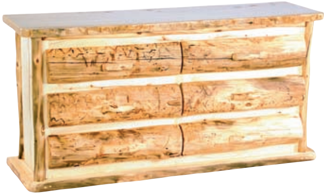
72" 6-Drawer Dresser

Our dressers and chests have solid wood construction on all parts, featuring 2" thick wood tops. We use high quality European drawer glides, hinges, and dove tail drawers. Our front and side skirt bases make our chests, dressers and armoires rock solid, while displaying true heirloom quality craftsmanship. Aspen handles add unique personality to each piece. All dressers are available with an optional tilt mirror .