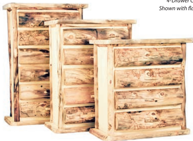
6-Drawer, 5-Drawer and 4-Drawer Chests

Drawers for the dresser, chest and lingerie chest can be cedar lined.