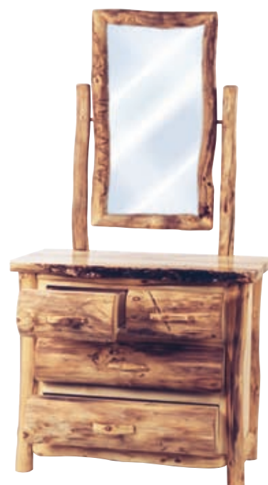
3-Drawer Chest with tilt mirror

Chest shown with leg option and split top drawer. This versatile chest is loaded with style and is a great accent piece.