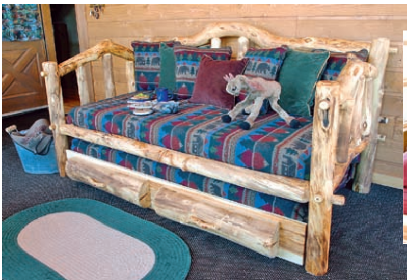
Snowload Daybed with trundle unit stowed under daybed

Our rustic daybeds do double duty as an attractive settee during the day, and a twin sleeper at night. Available with stowaway twin-frame trundle with half-log or flat faux drawer fronts to hide the trundle frame.