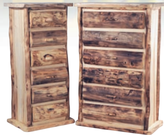
6-Drawer Lingerie Chest 6-Drawer Chest

Drawers for the dresser, chest and lingerie chest can be cedar lined.