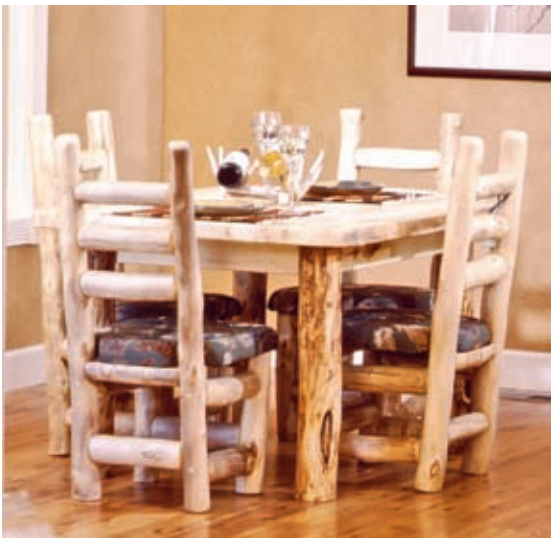
4' Dining Table with a leg base (an option on all dining tables) with Upholstered Side Chairs — perfect for small gatherings.

Bask in a rustic glow during all of your meals with our dining room table sets and complementary pieces. All of our dining room table tops are solid wood, and feature the natural curve of the log on the long edges. Our chairs have just the right pitch to keep you comfortable through dessert and are offered in a natural wood seat, or upholstered in the fabric of your choice.