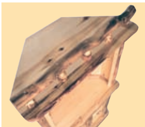
Top view of Corner Hutch

Utilize difficult corners with this elegant one-piece corner hutch. The upper section has two fixed display shelves with plate grooves, while the lower section has a fixed shelf and lots of storage behind a pair of handsome doors. The top rail and mountain scene on the doors are standard on this unique piece.