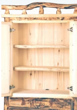
Adjustable shelves standard on Teton Armoires, and an option on all armoires.