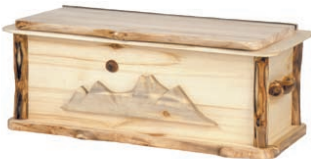
Cedar-lined Aspen Chest CC 48" x 24" x 24"

This beautiful heirloom chest works hard and looks great at the footboard of a bed! Lined throughout with aromatic cedar, with a removable sliding storage tray.