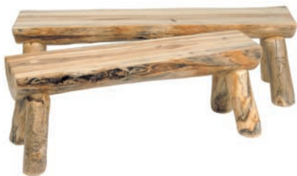
Half Log Bench

Choose from a wide selection of multi-tasking benches — perfect for the foot of the bed, or for extra seating elsewhere in your home when company arrives.