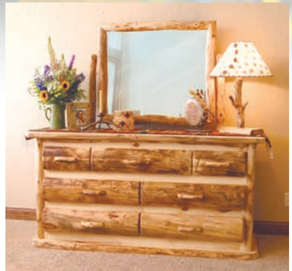
72" 7-Drawer Dresser with Mirror