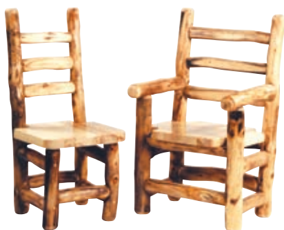
Side Chair and Captain's Chair

Side Chair DC 18" x 18" x 40" Captain's Chair DCA 24" x 18" x 40" Upholstered Side Chair DCU 18" x 18" x 40" Upholstered Captain's Chair DCUA 24" x 18" x 40"