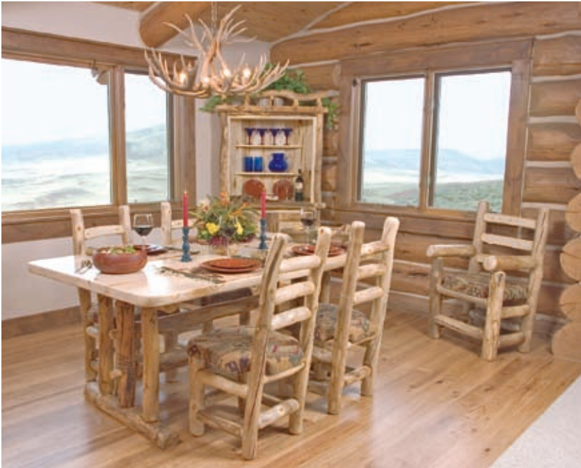
6' Dining Table with trestle base, Upholstered Side Chairs, Upholstered Captain's Chair and Corner Hutch