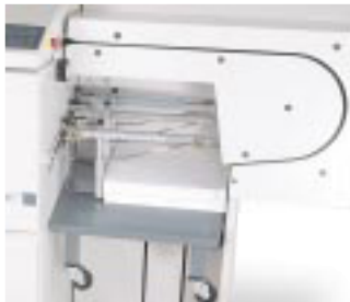
Unique turnover device keeps pre-collated work in perfect order, with Receding Stacker.