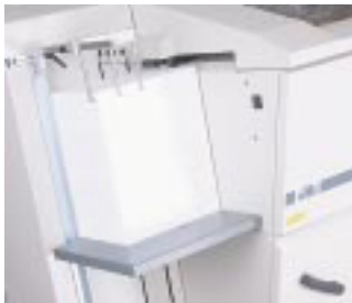
Top Feed Sheet Pickup with large capacity feeder of up to 14-1/2" pile.