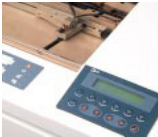
User-friendly Touch Key Controls maximize productivity.