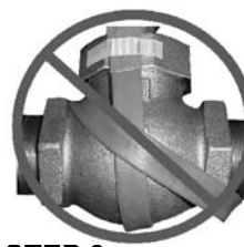
(C) Incorrect Installation: Heating tape overlapped on itself