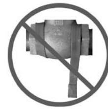
(A) Incorrect Installation: Heating tape hanging free from the surface