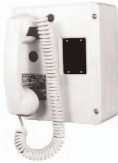
247-001 Indoor Phone