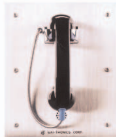
277-001 Flush Panel Phone