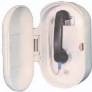
227-001 Tough Phone