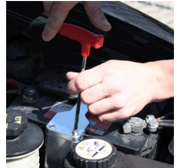
Line up the top bracket with the big side bracket and install allen bolts and tighten down securing the battery.