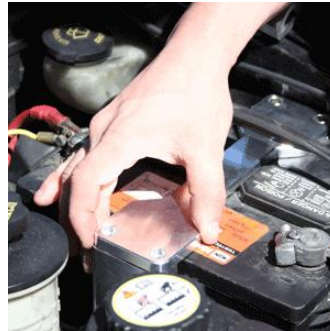
Install the short bracket to the bottom of one side of the top bracket with provided allen bolts. Place it on top of the battery.