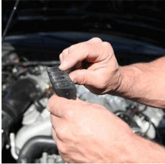
Remove factory battery hold down.