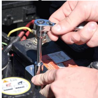
Screw the thread rod down so that the top of the rod sits below the body of the bracket then place the nut on top and tighten down.