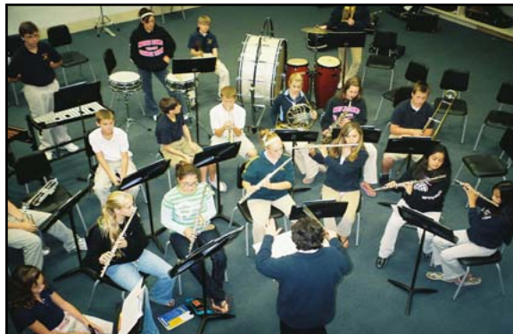
Band Practice at NDHS