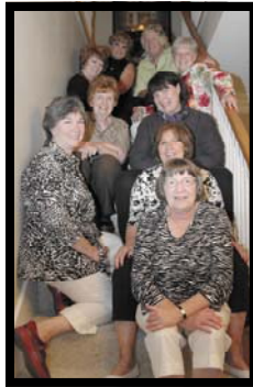
Class of 1963