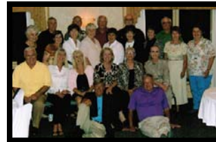
Class of 1964