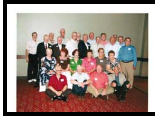
Class of 1959