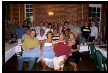
Class of 1974