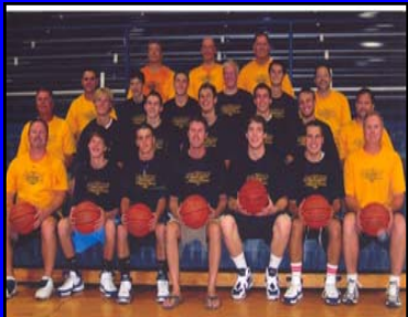
2008 Alumni Classic Basketball Game

The Notre Dame Foundation was established in 1982. The NDF is dedicated to providing financial support for the Notre Dame Schools by securing gift support from a wide circle of alumni, parents, parishoners, and friends of Notre Dame.