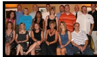
Class of 1989