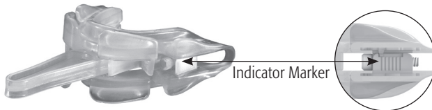
(Fig. 2) Insert the separator into the mouthpiece through the back. Do not fit the device with the lower portion forward.