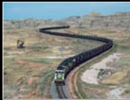
BN in the Badlands