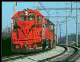
Diesels Under Wire