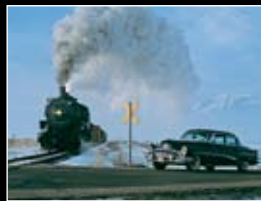
Thundering Toward Heber City