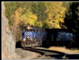
Autumn and Mullan Pass Helpers