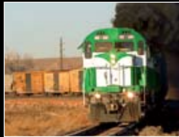
Giving Steam Locomotives a Run For the Money