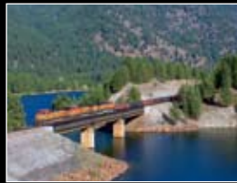
Beautiful Bridge 50