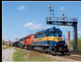
Rainbow in Milwaukee