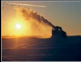
Not Your Father's Snowblower