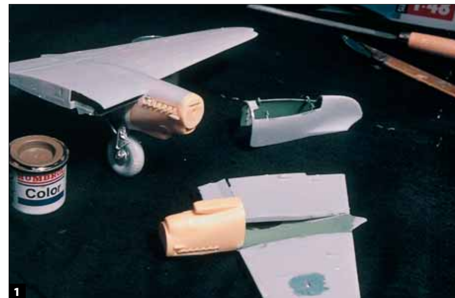
1 The Paragon engines, designed to fit the Airfix wings, are mounted to the top surface. The remaining Airfix nacelle (right) awaits attachment.