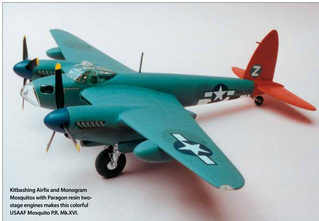
Kitbashing Airfix and Monogram Mosquitos with Paragon resin two-stage engines makes this colorful USAAF Mosquito P.R. Mk.XVI.

A green modeler turns a 1/48 scale Mosquito PRU Blue BY STEVE RICHARDS