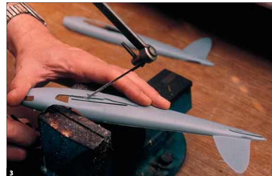
3 A coping saw was used to remove the wing mounts from the Monogram fuselage halves before attaching the Airfix wings.

Plastic cements have no effect on resin parts, so you must use super glue, epoxy, or epoxy putty to bond resin to plastic. I used super glue, then filled the seams with Milliput, a two-part, fine-grained epoxy putty. It sets hard, but with progressively finer grits of sandpaper it sands easily to