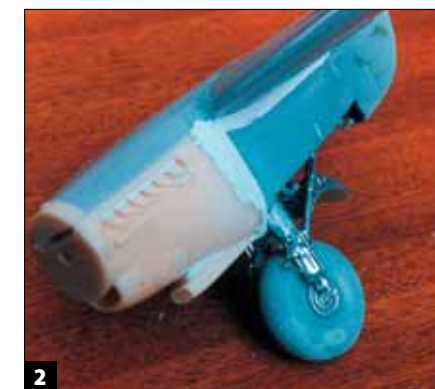
2 Sanding the epoxy-putty-filled seams on the assembled nacelle is next.

Engine change. The major difference between the kit Mossies and the P.R. Mk.XVI was the shape of the Rolls-Royce Merlin 72 two-stage engines. The Merlin 72 nacelles were slightly longer and shaped differently. The Paragon engine nacelles capture this shape, but you have to remove much of the Airfix nacelles to fit the new ones.