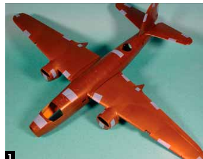
1 Taping the major pieces together reveals potential fit problems that will have to be corrected.