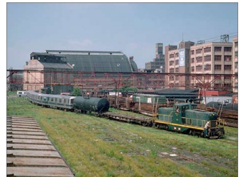
A New York Dock GE switcher drags a cut of cars from the car float lead. The subway cars are returning from shop work in New Jersey.

York, and retains a rare survival of an isolated freight railroad served only by float bridge."