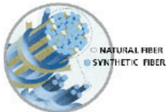
Dri-release Cross section