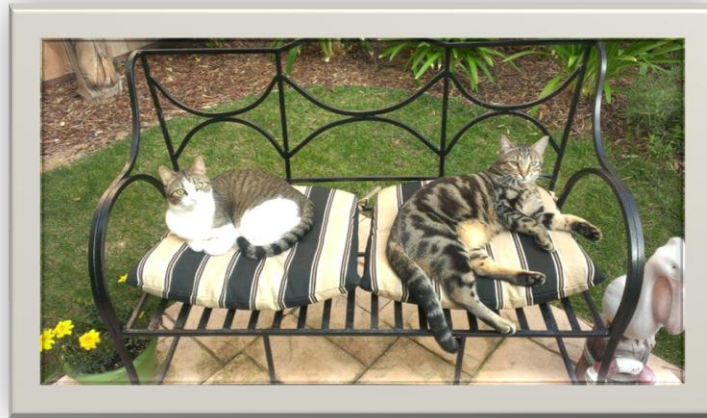
Katniss and Downton's owner purchased raffle tickets for Animal Fest and won the Haley & Loyd necklace!

Thanks to everyone who came out and supported PAWS and for those who purchased raffle tickets!