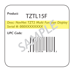
Sample UPC Label